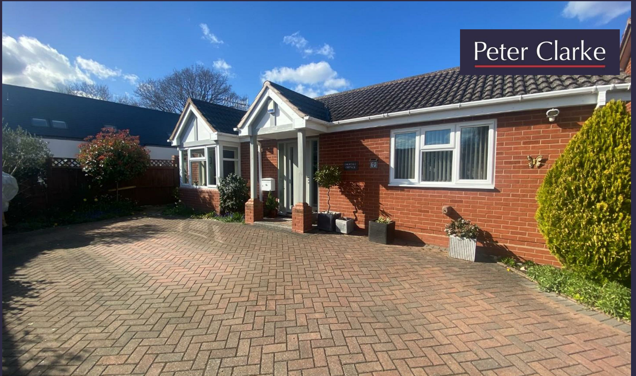
Churchill Cottage, 6A Winston Close, Shotton, Stratford-upon-Avon, CV37 9ER